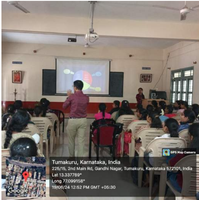
Tumakuru, Karnataka, India 225/15, 2nd Main Rd, Gandhi Nagar, Tumakuru, Karnataka 572101, India Lat 13.337789° Long 77.099158° 19/06/24 12:52 PM GMT +05:30