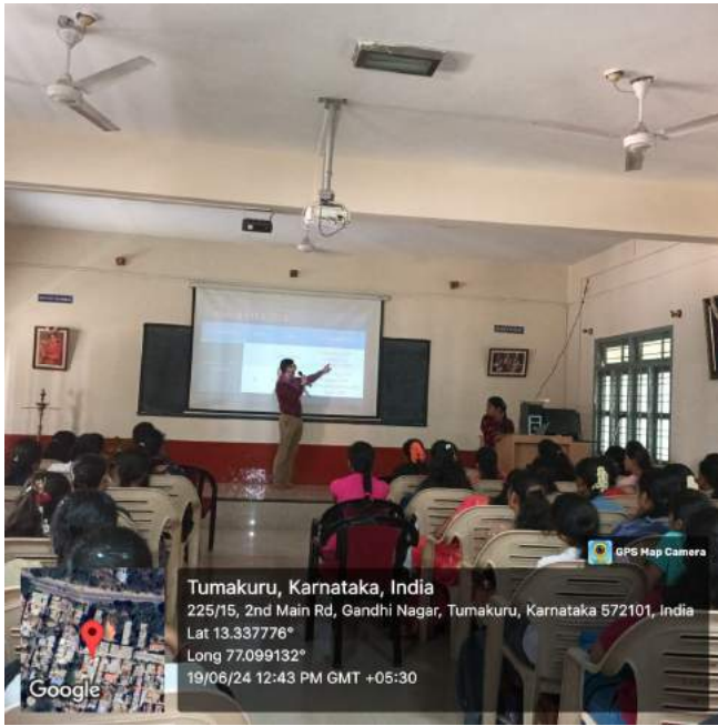
Tumakuru, Karnataka, India 225/15, 2nd Main Rd, Gandhi Nagar, Tumakuru, Karnataka 572101, India Lat 13.337776° Long 77.099132° 19/06/24 12:43 PM GMT +05:30