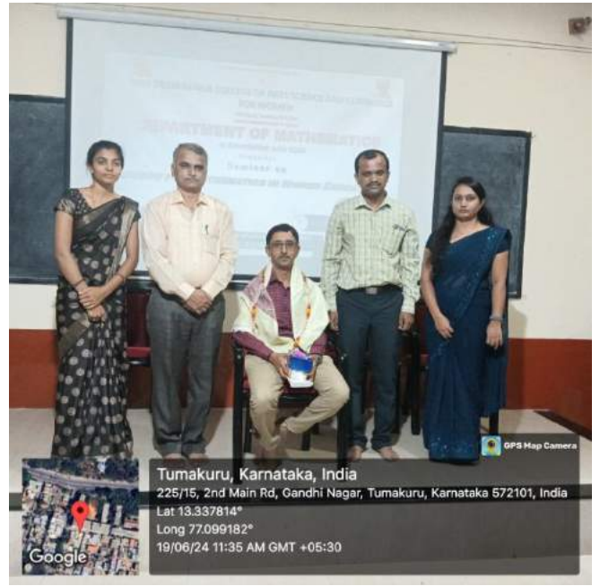
Tumakuru, Karnataka, India 225/15, 2nd Main Rd, Gandhi Nagar, Tumakuru, Karnataka 572101, India Lat 13.337814° Long 77.099182° 19/06/24 11:35 AM GMT +05:30