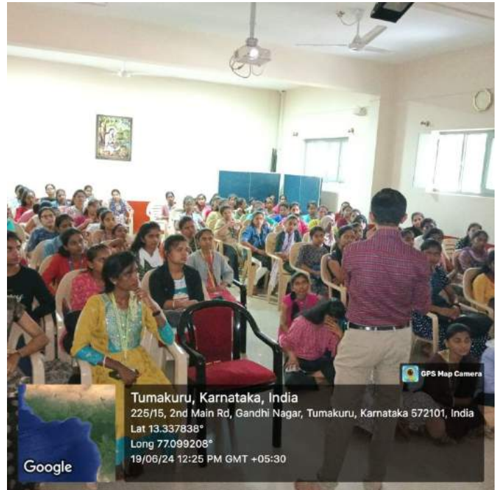
Tumakuru, Karnataka, India 225/15, 2nd Main Rd, Gandhi Nagar, Tumakuru, Karnataka 572101, India Lat 13.337838° Long 77.099208° 19/06/24 12:25 PM GMT +05:30