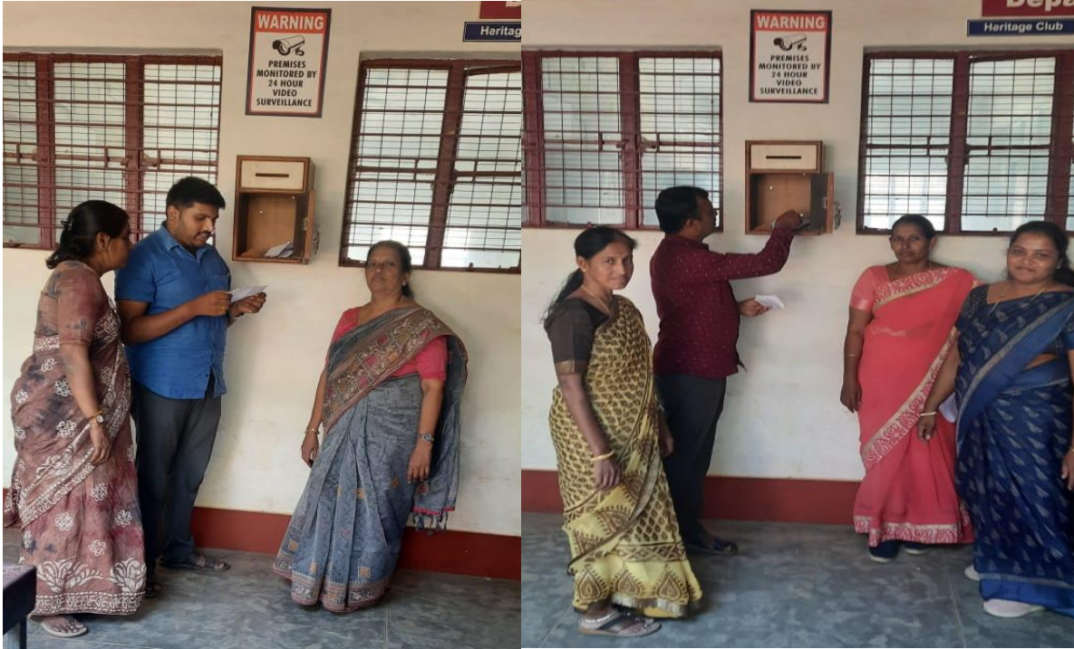
Suggestion/Complaint box opened by Committee members

B.H. Road, Tumkur-572102. Karnataka Ph: 0816-2272312 E-mail : sscasc.women@gmail.com Website : www.sscwtumkur.org