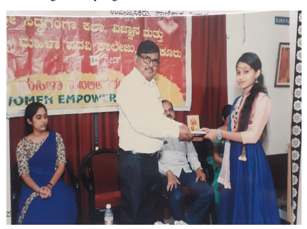
Prize distribution for winners