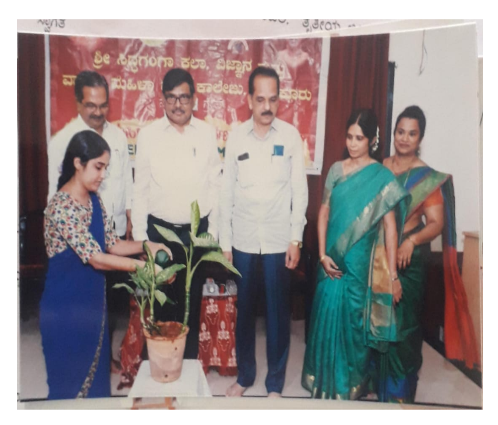
Inauguration by Dignitaries