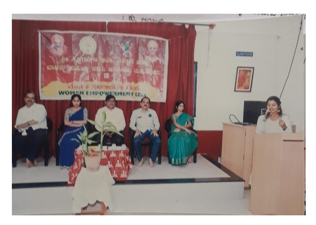
Invocation by Anjali II BCA