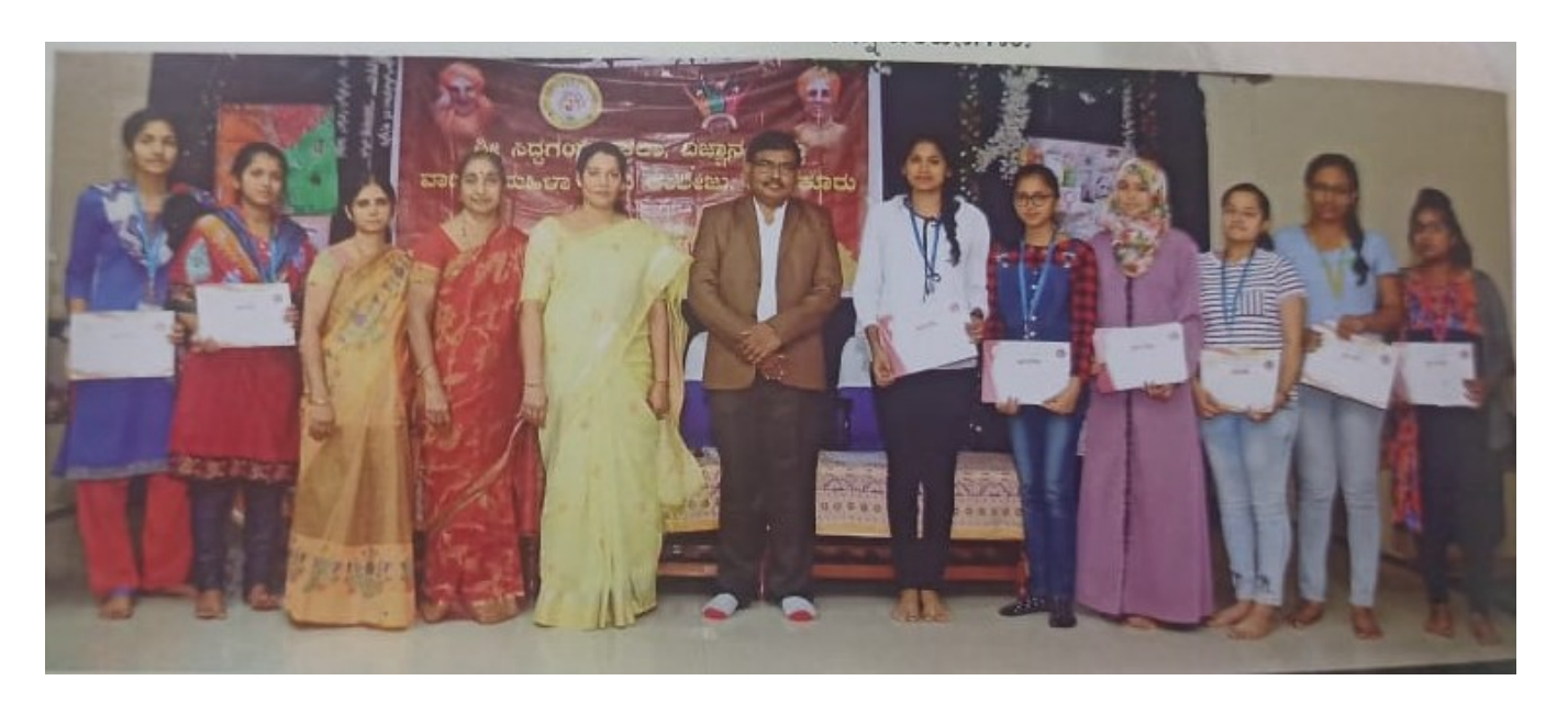
Lecture competition on Role of women in nation building organized by Women Empowerment Cell